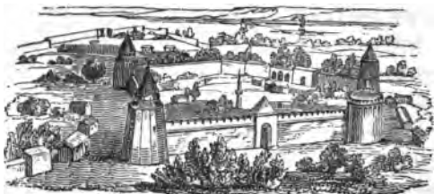
Castle of the Seven Towers.